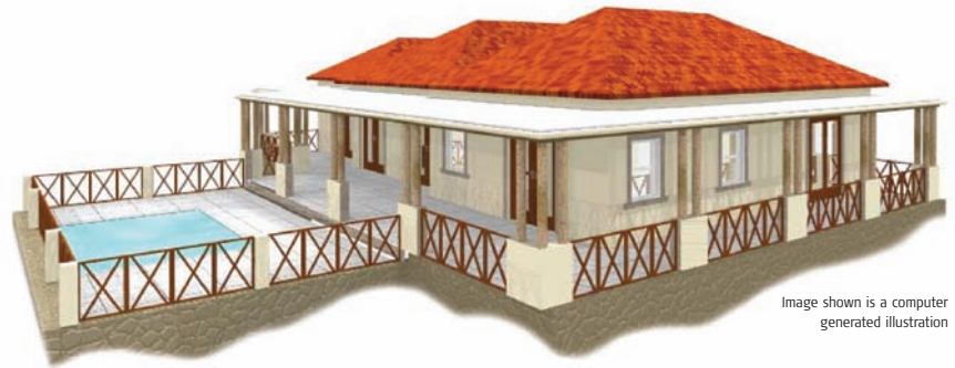
Image shown is a computer generated illustration