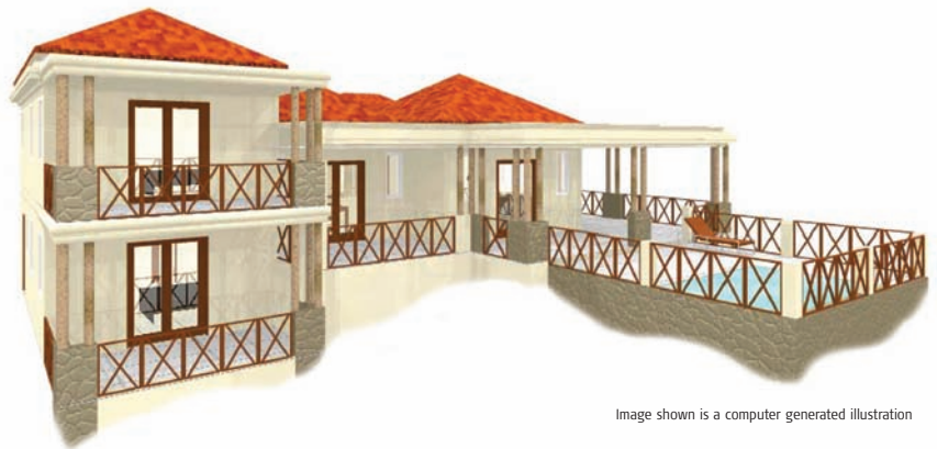
Image shown is a computer generated illustration